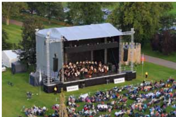
16m x 14m Prolyte Custom CLT at Glamis Castle

Alongside the Prolyte Bandstand XL, we also have a new Prolyte Custom CLT stage, which was in operation at the end of last summer, and is already attracting bookings for 2012. The massive 16m x 14m stage has a clear trim height of 9m, with a roof loading of 10000kg, plus 4000kg on optional PA wings. The CLT Roof System is constructed from S52SV grid truss supported by seven S40T truss towers from the Prolyte Structures range. A Layher Allround Scaffolding system constructed from EV100 Event Decks that form the stage platform. Adjustable Layher base adaptors support the truss towers, and tie the structure into the platform.